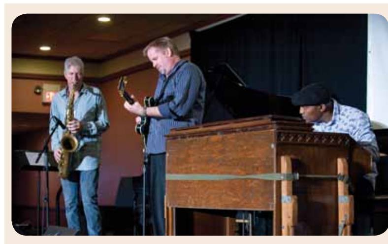
▲ Bob Mintzer, Dave Stryker and Bobby Floyd (from left)