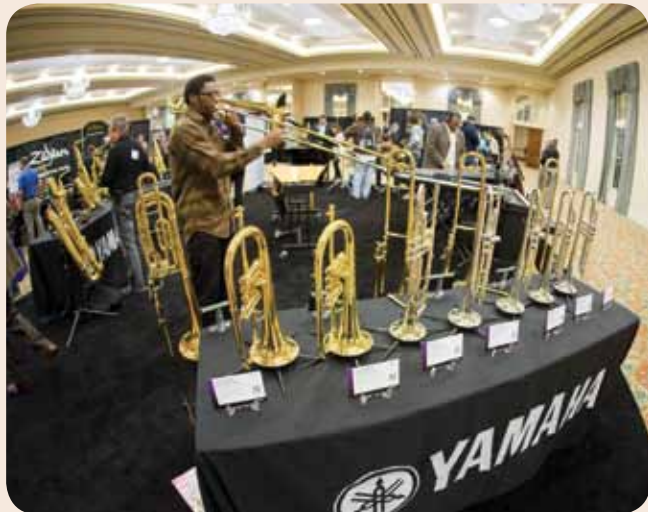
▲ Yamaha brass in the exhibit hall