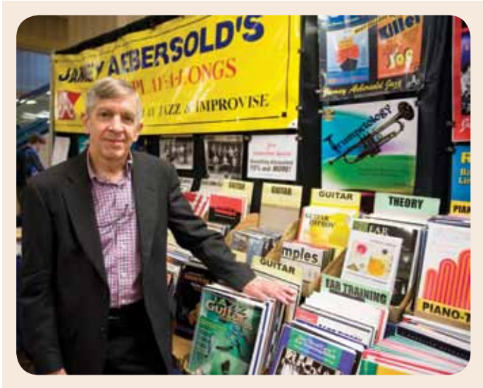
▲ Jamey Aebersold and his wares