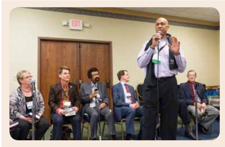
▲ John Clayton introduces a panel celebrating the career of David Baker