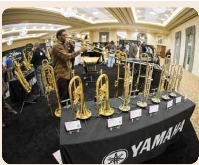
▲ Yamaha brass in the exhibit hall