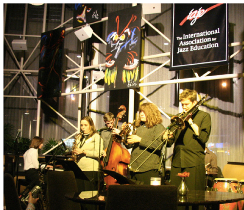
IAJE '08 BTW Jazz Combo I at the Intercontinental Hotel concert.